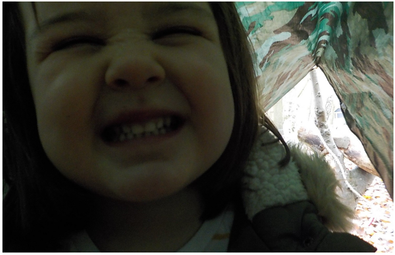
The absolute joy of being in a spooky, flappy den! in the woods, in winter, with our friends.

The pride in learning how to swing on a stick swing!